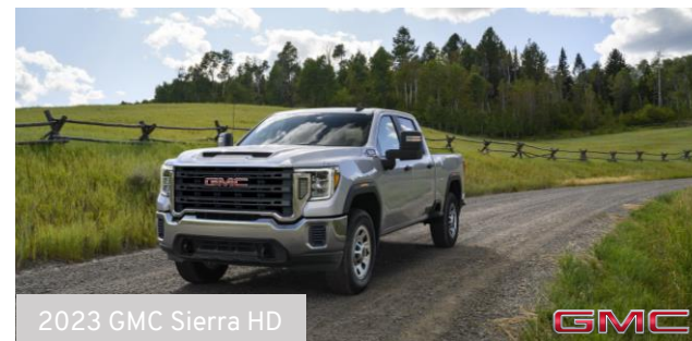
2023 GMC Sierra HD