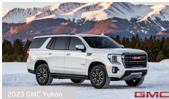
2023 GMC Yukon