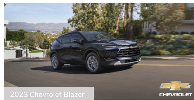
2023 Chevrolet Blazer