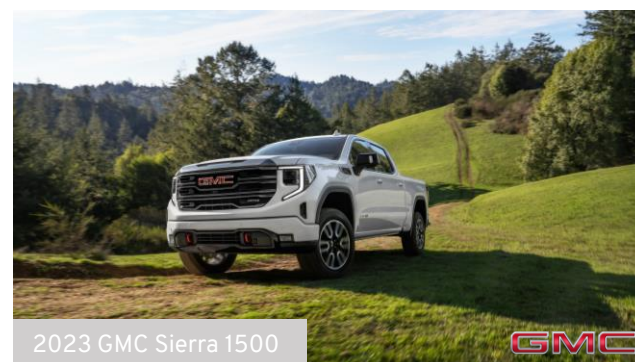
2023 GMC Sierra 1500