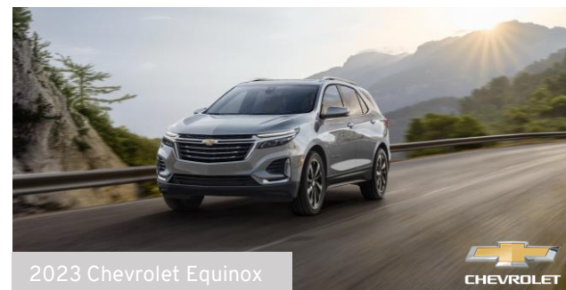
2023 Chevrolet Equinox