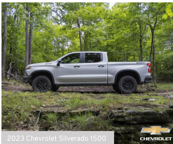
2023 Chevrolet Silverado 1500